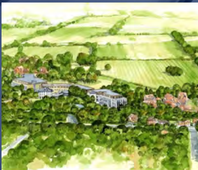
Oakhill House, Hildenborough