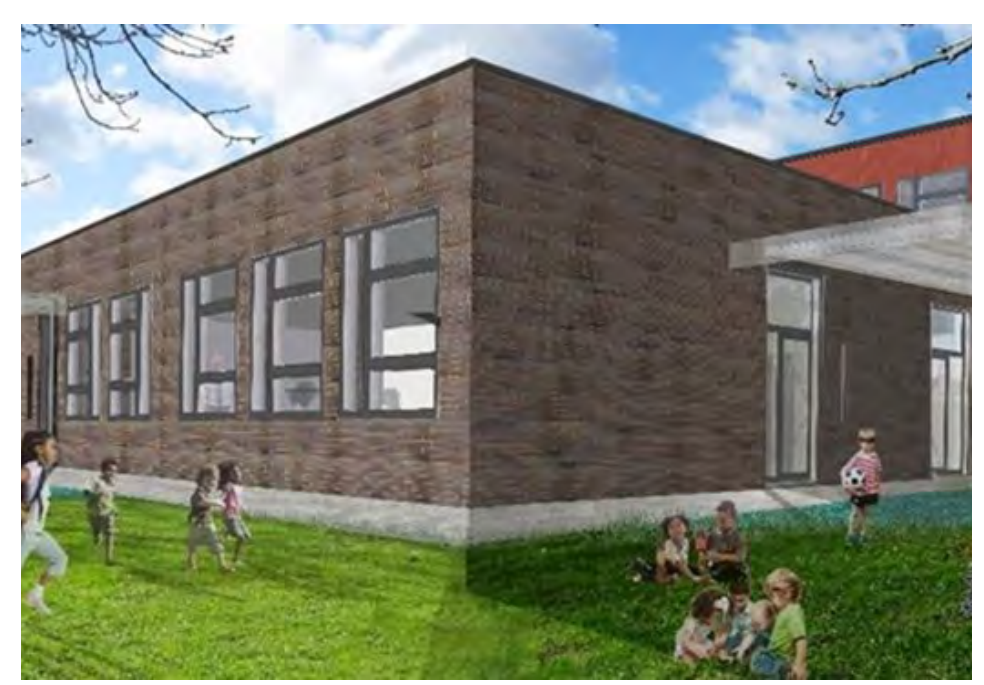
Curl la Tourelle Architects